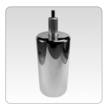
• EW3 (shown with SF23)