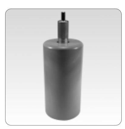
• EW4 (shown with SF23)

EW-type tensioners are intended for use (with the SF23 tensioner) where a permanent attachment to the floor is not desired or possible. They allow for quick and easy installation, reposition and removal or cable hung artwork and photos, signage and graphics, shelves, privacy screens and/or room dividers.